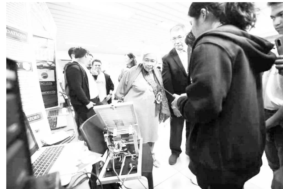
(From page 6)

the Department has started changing its learners assessment approach from fact-based questions to real world problem solving and application. "The only constant in education is change. The more we prepare our learners before going out to a world where practices and principles are already different, then they will be in a better position to accept and look for innovation," she said.